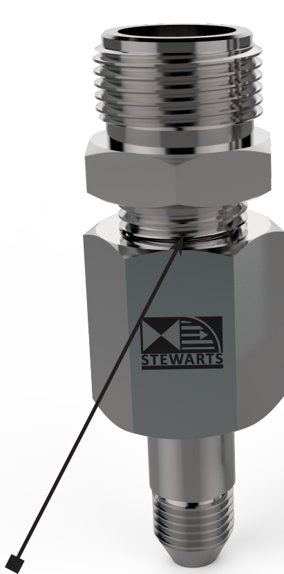
Standard ANSI/ASME B1.20.1 NPT Thread