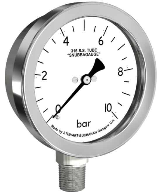
Snubbagaug ® , 4" Direct Mounted (Standard) The "Snubbagaug" is available in all our applicable configurations, Please contact our sales advisors for technical assistance.

Snubbagaug ® 'SNUBBAGAUG ® ' is a registered trade mark of Stewarts. A special machined piston which has been installed in the socket of the pressure gauge gives perfect resistance to shocks and surges. It does not interfere with the safety features of the instrument.